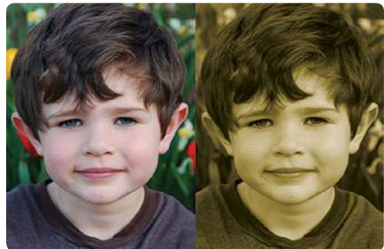
Left, normal vision. At right, dull or yellow vision.