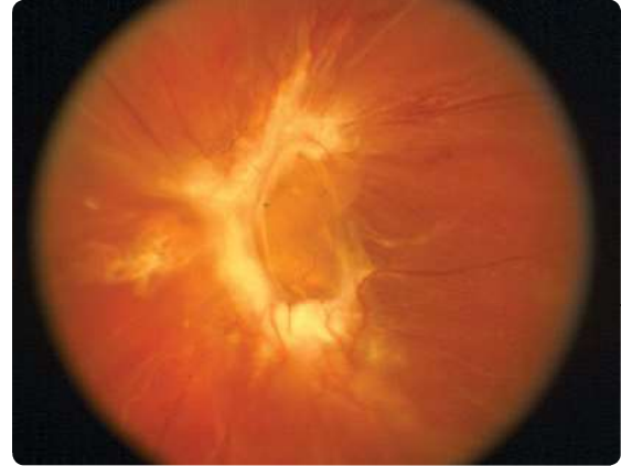
Traction retinal detachment

With diabetic retinopathy, you may have fluid or particles in your retina, affecting your vision.